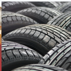
BULK CHEMICALS AND INTERMEDIATES