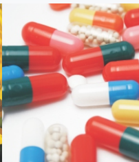
PHARMACEUTICALS AND INTERMEDIATES