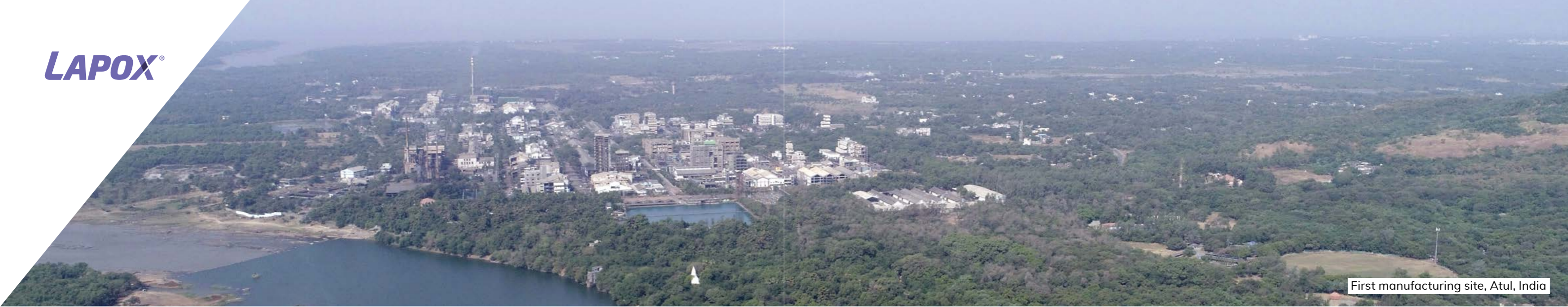
First manufacturing site, Atul, India