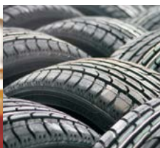
BULK CHEMICALS AND INTERMEDIATES